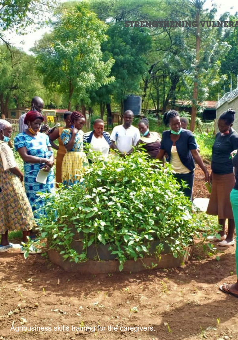
Agribusiness skills training for the caregivers.