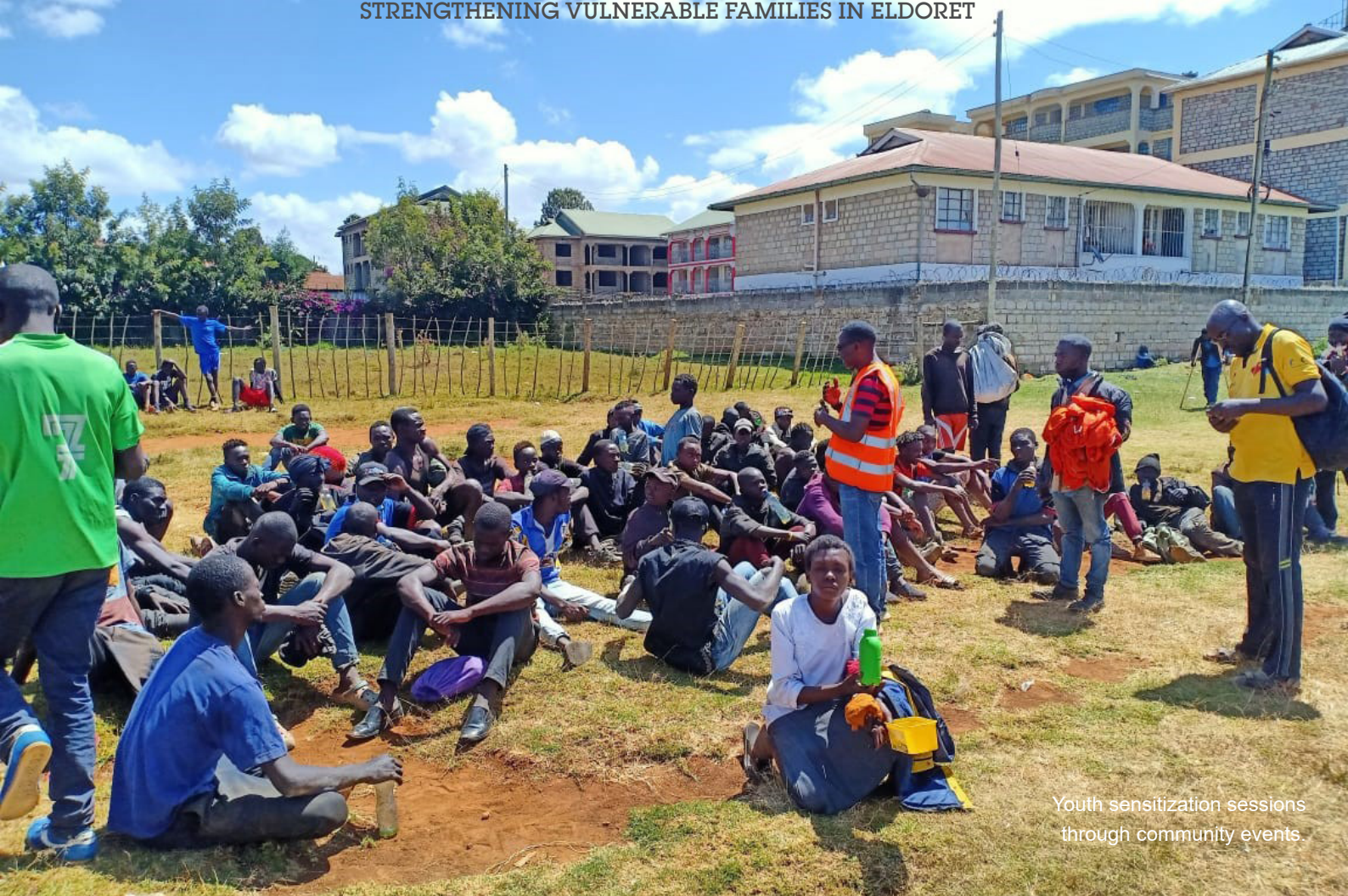
Youth sensitization sessions through community events.