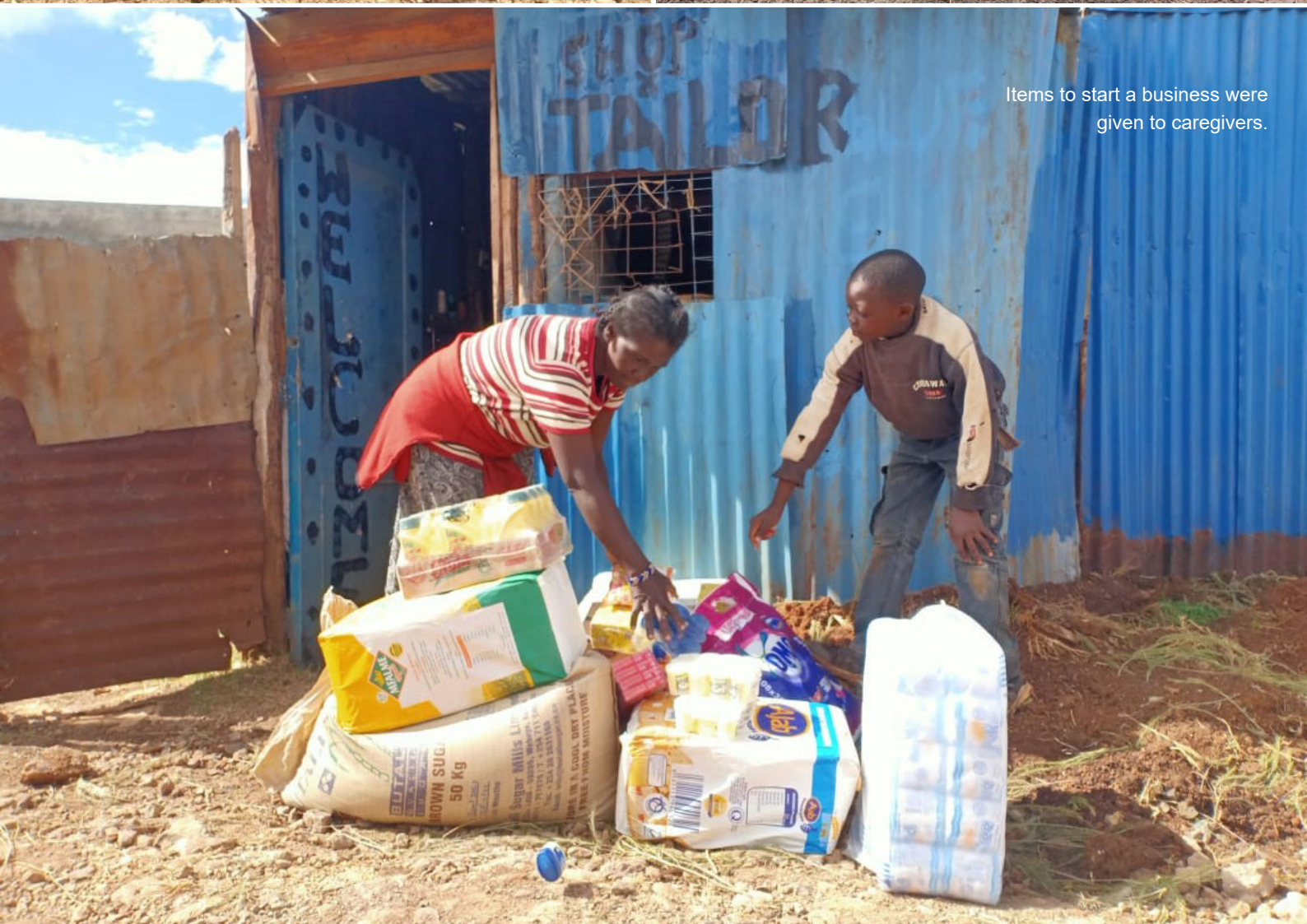
Items to start a business were given to caregivers.