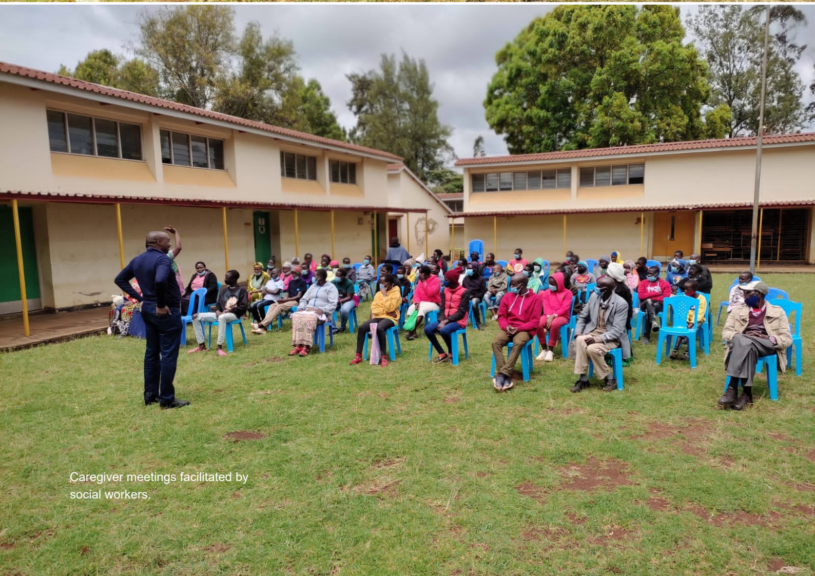
Caregiver meetings facilitated by social workers.