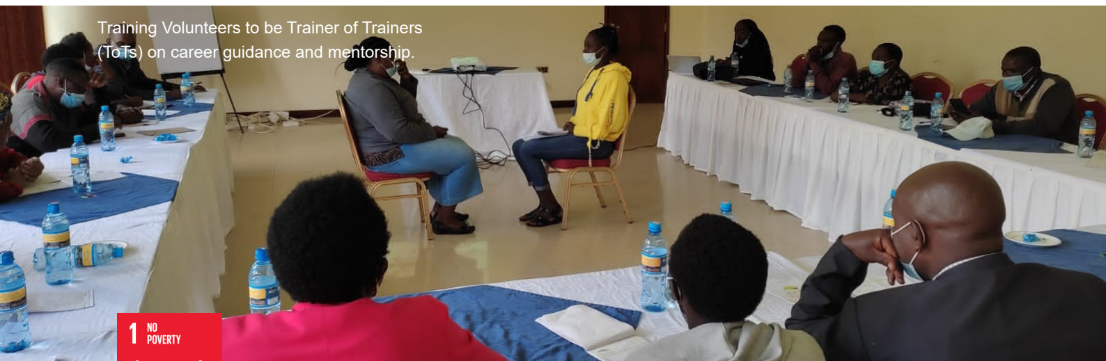
Training Volunteers to be Trainer of Trainers (ToTs) on career guidance and mentorship.

Training on child protection was given to 65 religious people who work directly with children in their religious communities. As duty bearers, they will support child protection awareness, prevention, reporting and response.